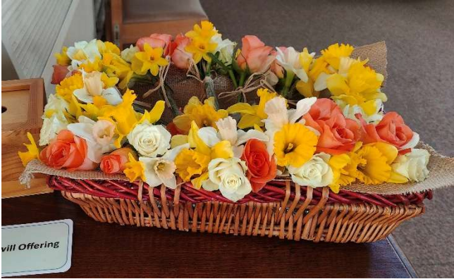
Flowers for Mothering Sunday, and Easter day flowers by the empty cross