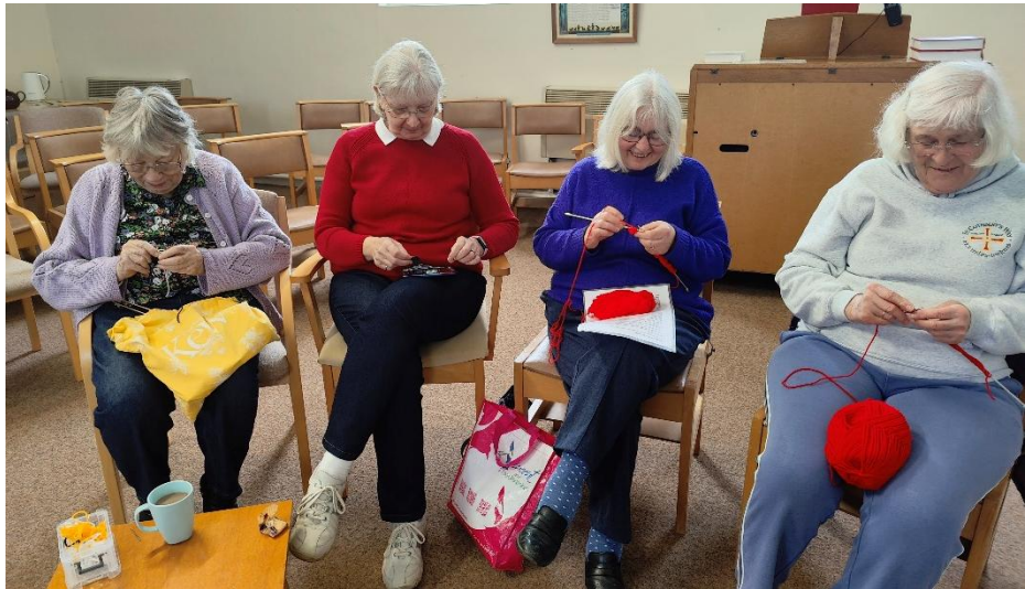
February our second Craft & Laugh