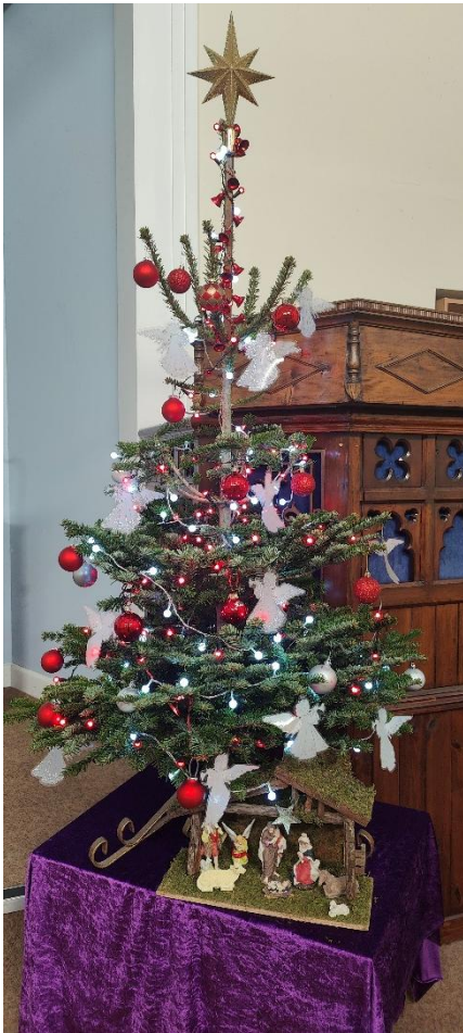
December – our Christmas tree at PMC